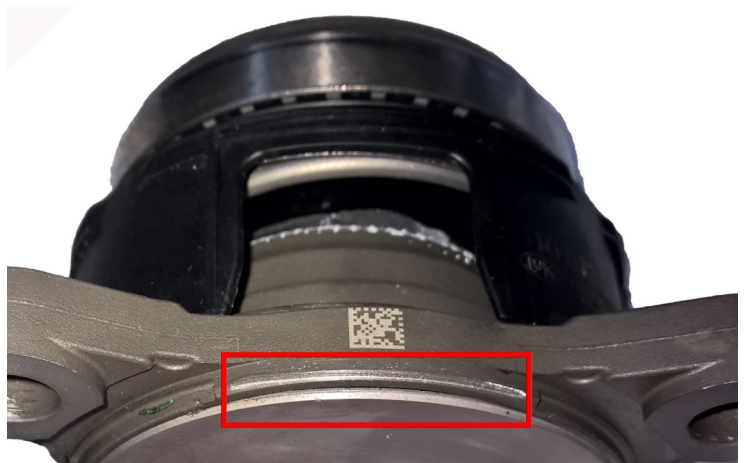
Fig. 2: Damaged concentric slave cylinder with separated gasket