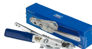
Utahovač pásek: VKN 400

Pro profesionální opravu při utahování svorek doporučujeme použít nástroj SKF VKN 400. Nesprávné utažení svorek může způsobit předčasné selhání kloubu!