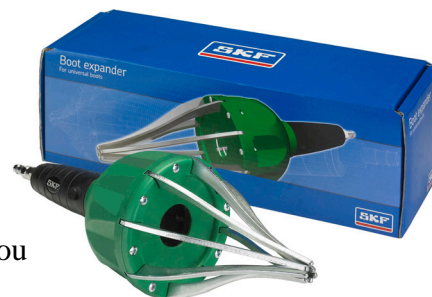
Roztahovač manžet: VKN 402

VKJP 01011 vyrobená z pružného pryže zaručuje rychlou a snadnou montáž pomocí vzduchového roztahovače SKF VKN 402 bez nutnosti demontáže kloubu z hřídele.