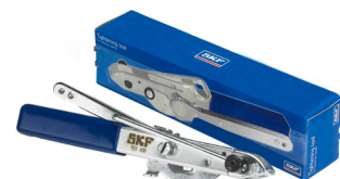
Zange: VKN 400

Für das Befestigen der Endlosschellen empfehlen wir das Spann- und Schneidwerkzeug VKN 400.