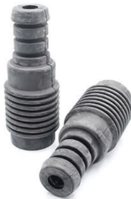
Example of dust cover appearance with wax paraffin

Please take into account that some dust covers inside Strut Protection Kits (VKDP) are made of Natural Rubber that is a resistant material used to produce Original Equipment parts. For this type of rubber, a paraffin wax is added in the material for ozone protection, therefore dust covers might have a "white dust" appearance that is completely normal and it is not related to the quality of the parts. This appearance is also normal in the OE suspension parts made with natural rubber.