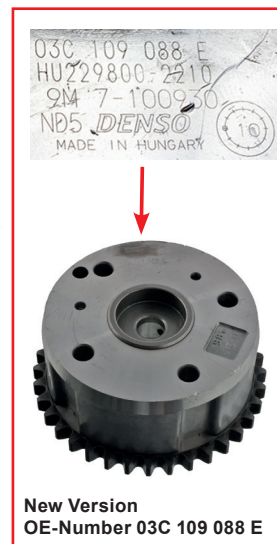
New Version OE-Number 03C 109 088 E

Further information may be obtained at: www.febi.com