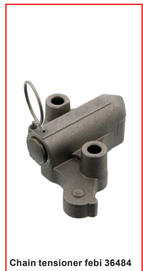
Chain tensioner febi 36484