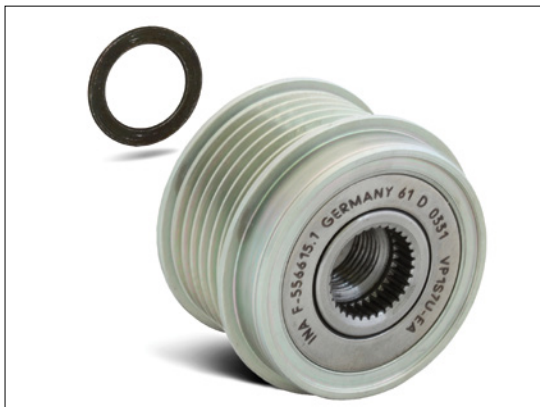
Image 2: When installing the over-running alternator pulley on a Bosch alternator, the enclosed spacer with a thickness of 1.4 mm must be used!

Due to the strong, dynamic movements of the V-ribbed belt, loud noises may be produced in vehicles with a rigid alternator belt pulley.