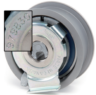
Photo 2: 531 0851 10 – New tensioner pulley (979830)

Due to modified specifications, the tensioner pulley 531 0851 10 replaces tensioner pulley 531 0777 10.