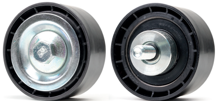
Figure 1: Previous design

Both comply with the technical specifications and can be used without restrictions.