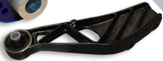
Complete Mounting - ADT38056C