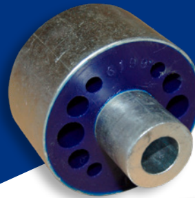
Polyurethane Bush - ADT380145

Toyota Hiace, Granvia, Grand Hiace (Grey Import) all models 1995>